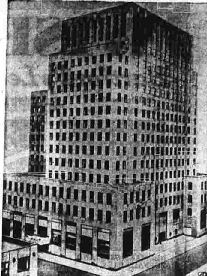
The New York headquarters of The Associated Press, for 15 years located at 213 Madison Avenue, soon will move to this new Associated Press building at 50 Westchester Plaza.