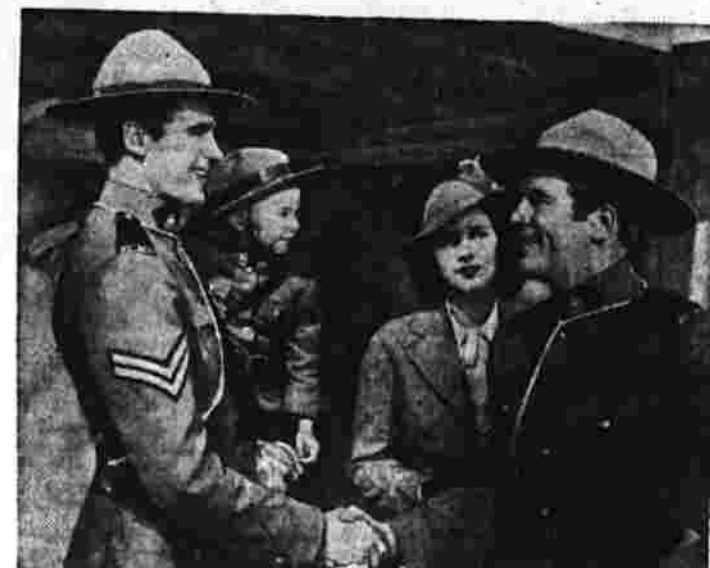
Another fine technician by Warner Brothers, "Nancy Drew, Detective" is the co-feature, starring Dick Foran and Gloria Dickson at the State theater Sunday and Monday.